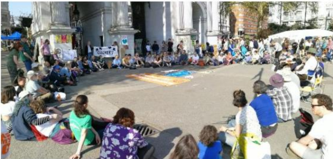
Meeting for worship at Marble Arch Extinction Rebellion on Good Friday.

We encourage any other Quakers who were arrested to inform Meeting for Sufferings by emailing the dedicated address, sufferings@quaker.org.uk , with as much accurate information as possible – for example, names, Area Meetings, dates, charges, and sentence.